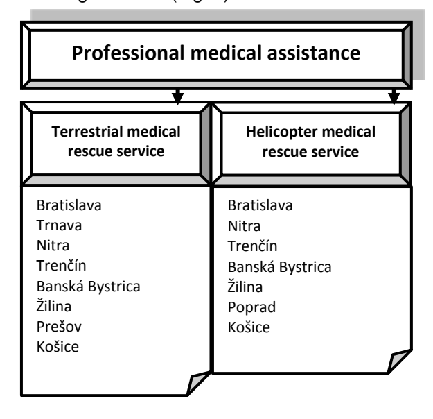
Fig.2 Centres of professional medical assistance

Helicopter rescue service is in the state of alert 24 hours a day in the centres listed in the following overview (Fig. 2).