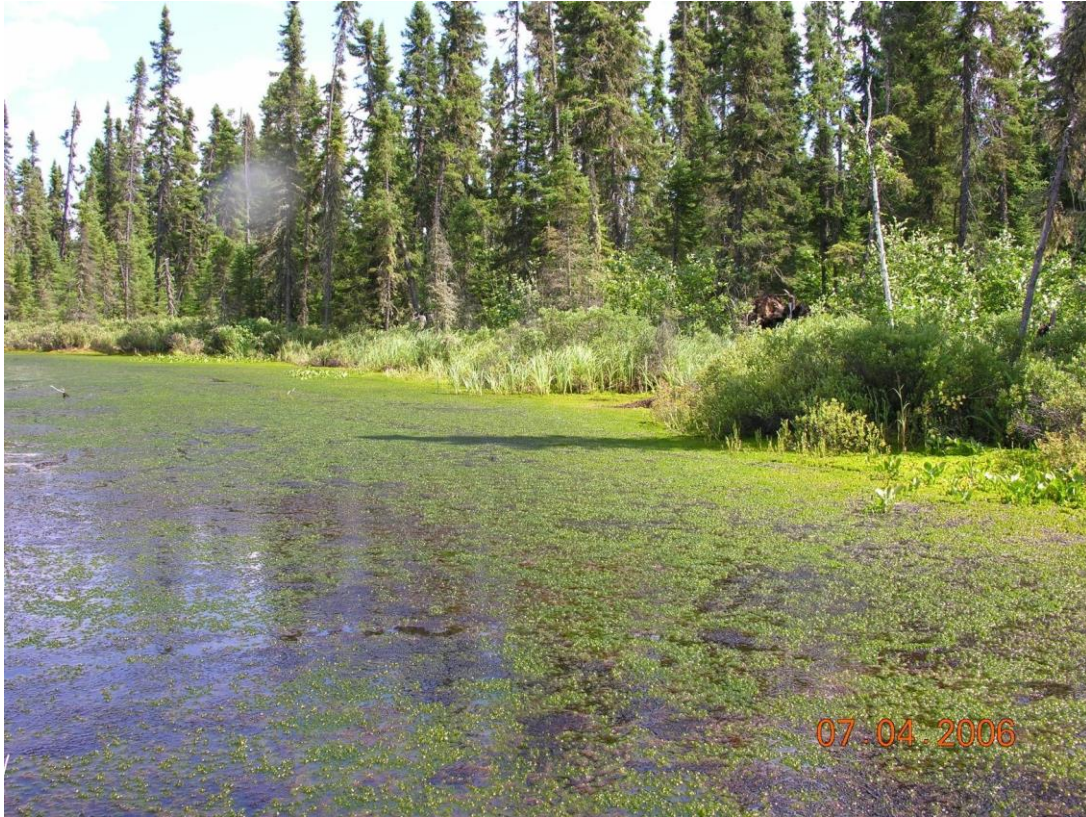
Figure 3. Acidic lake outflow in 2006. Note that aquatic vegetation and aquatic moss reduce lake turnover and re-suspension of metal-laden sediments.

IWP was tested using 3 t of waste rocks (in sizes from 0.01 to 0.25 m diameter) from a zinc mine in Quebec. About 5 L of Natural Phosphate Rock was dumped onto waste rock in 70 L plastic garbage containers (drums), others were left as controls. The drums were exposed outdoors in Toronto, Canada for 2.7 years. Drums without NPR generated acid rock drainage (ARD) for the length of the experiment, while those with NPR stopped producing acid after the first winter; instead, generating a pH neutral and low acidity effluent. Effluents stayed pH neutral after being re-exposed for one season outdoors after 4.5 years of storage in a damp basement. These results were presented at conferences (Kalin et al., 1995a ,b, c; Kalin, 1998) and published (Kalin and Harris, 2005).