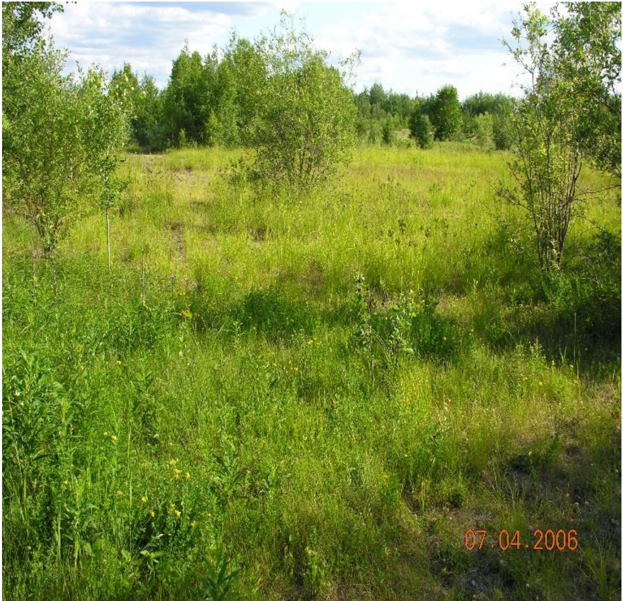
Figure 2. Tailings vegetation cover in 2006, three years after application of NPR to the surface of the tailings. NPR was to produce a hardpan to slow water movement into the tailings. Unfortunately, we were not able to sample after 2003.

vegetation. The introduced moss carpet flourished, and covered the lake sediments, as documented in 2006 (Fig. 3). As of 2006, the pH of the lake had stabilized. No follow up was carried out on this system for more than a decade. Recently, though, monitoring data from the regulatory body of Ontario Canada show promising results, suggesting that the lake system may have stabilized, even though there is continued input of AMD from the tailings and underground workings.