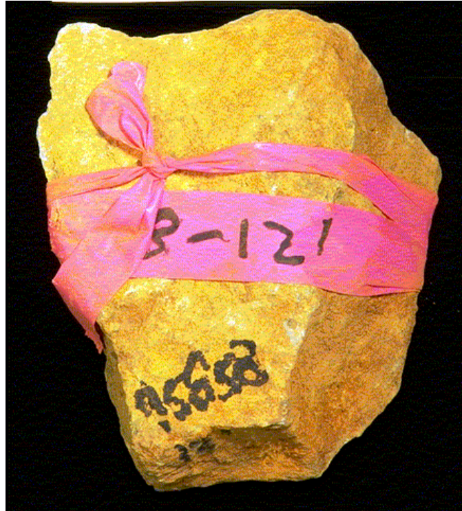
Figure 1: One of the rocks from the sections of the Gibraltar leaching dump received for the surface investigations at the U of Toronto, Geology.

For ecologists, the Gibraltar rocks were evidence that the oxidation (weathering) of rock surfaces could be reduced, a goal of the ecological engineering decommissioning approach (Kalin, 1989, 1998). Microbes live in biofilms on surfaces. We hypothesized that the Gibraltar heap leach rocks stopped leaching because they were coated, not with iron-phosphate, but with a biofilm of fast-growing heterotrophs, which covered the sulphidic mineral surface, consuming oxygen. There was enough phosphate in the local minerals to provide nutrients for acidophilic heterotrophs that live in the same acidic environment as chemo-lithotrophs, but are usually outcompeted or dormant (Harrison et al., 1980). However, when conditions are changed these heterotrophs grow, consume oxygen, and or produce growth deterrents to inhibit the oxidation caused by chemo-lithotrophs (Marchand and Silverstein, 2002).